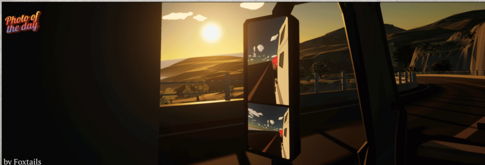
Photo of the day